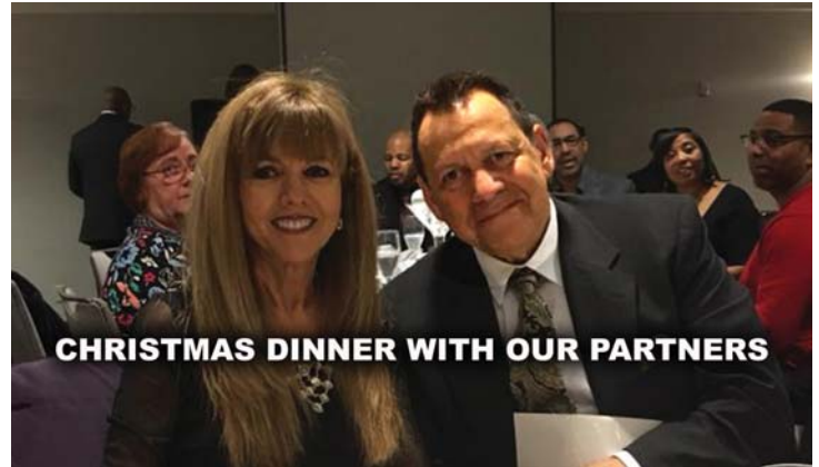
CHRISTMAS DINNER WITH OUR PARTNERS

Luke 2: 25 "And behold, there was a man in Jerusalem whose name was Simeon, and this man was just and devout, waiting for the Consolation of Israel, and the